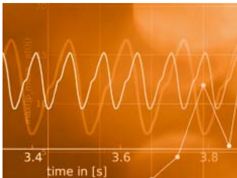
Pulsation studies and pipeline calculations