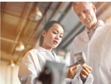
Creative development and refinements