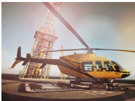
Commissioning and maintenance service