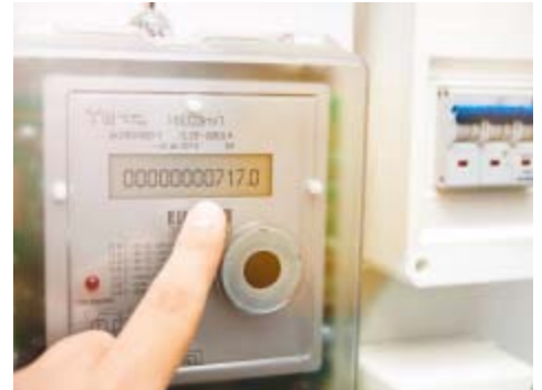
Lifecycle concepts and energy optimization