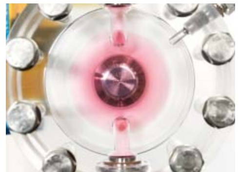
Spare part and service concepts